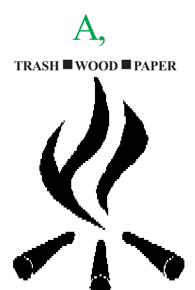
Type A extinguishers fight ordinary combustibles such as burning wood, cloth, paper, rubber, upholstery, and plastics.